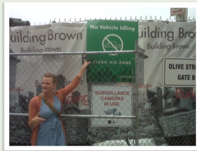
Diesel Pollution Patrol