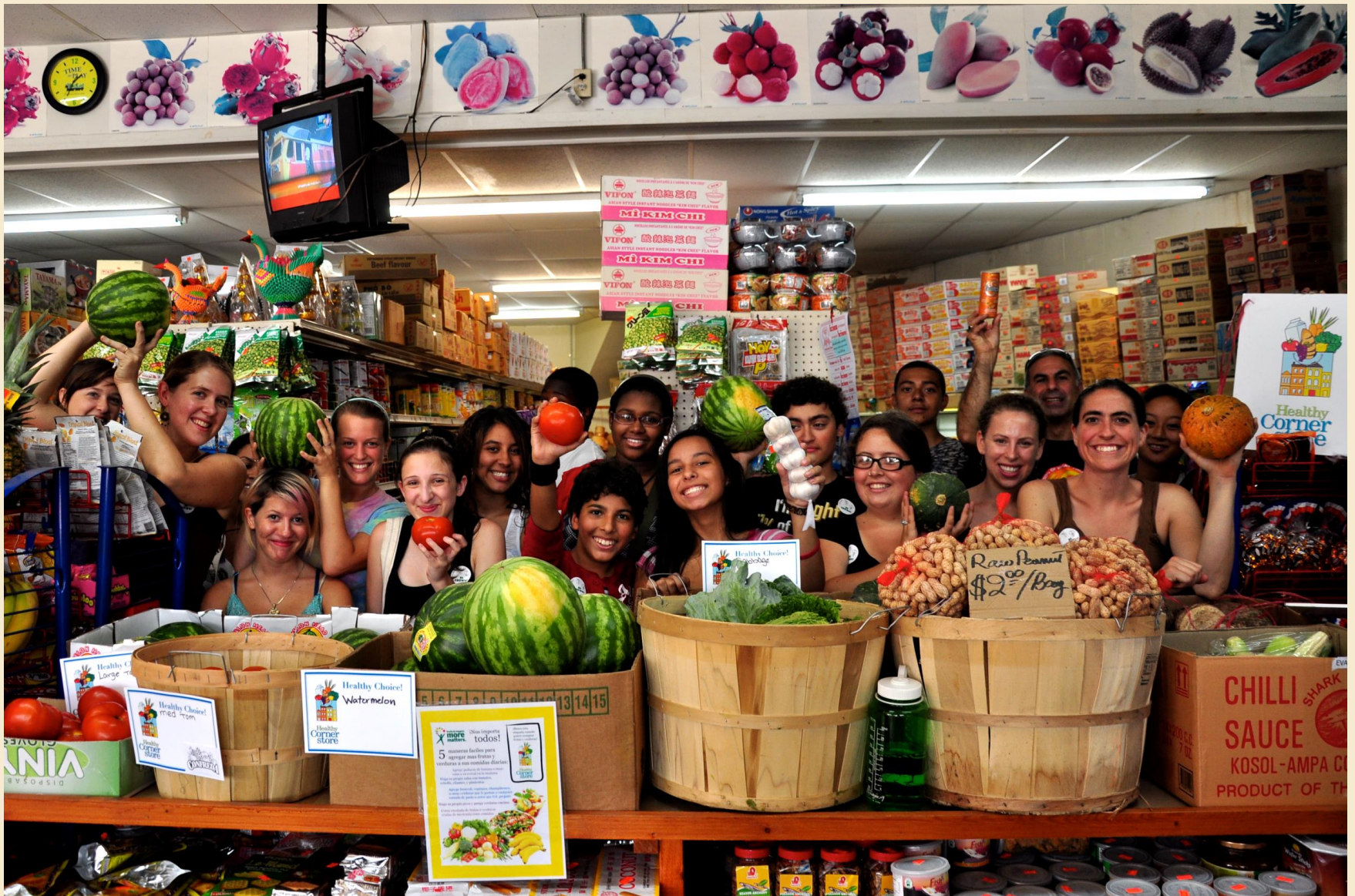
A Healthy Corner Store opening